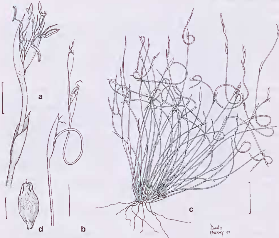
Fig. 2. Kulinia eludens . a, male inflorescence (Briggs 8530). b, c, female: b, inflorescence. c, habit (holotype). d, fruit (Briggs 9352). Scale bars: a = 3 mm; b = 6 mm; c = 2.5 cm; d = 1.2 mm.

The epithet refers to the species eluding us and not being found on our first attempts to locate the site of its original discovery.